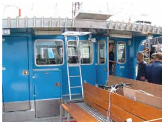
Rear Deck Area