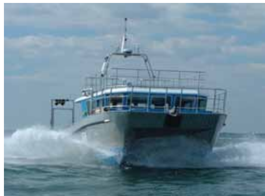
Foredeck & Wheelhouse

Aluminium Boatbuilding Co. Ltd. Mill Rythe Lane Hayling Island Hampshire PO11 0QG paul@abcsales.co.uk