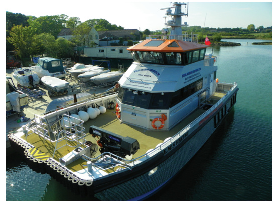
Foredeck & Wheelhouse

Aluminium Boatbuilding Co. Ltd. Mill Rythe Lane Hayling Island Hampshire PO11 0QG paul@abcsales.co.uk