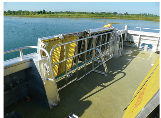
MOB Recovery System