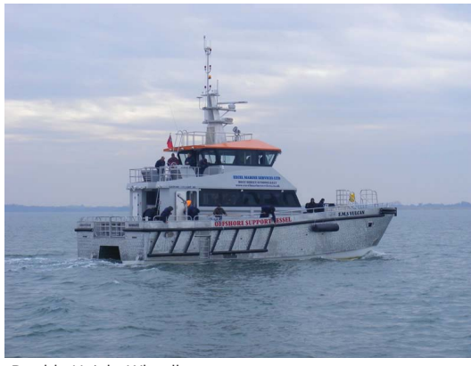
Double Height Wheelhouse

Aluminium Boatbuilding Co. Ltd. Mill Rythe Lane Hayling Island Hampshire PO11 006 paul@abcsales.co.uk