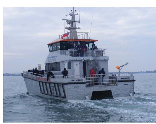
From the Stern