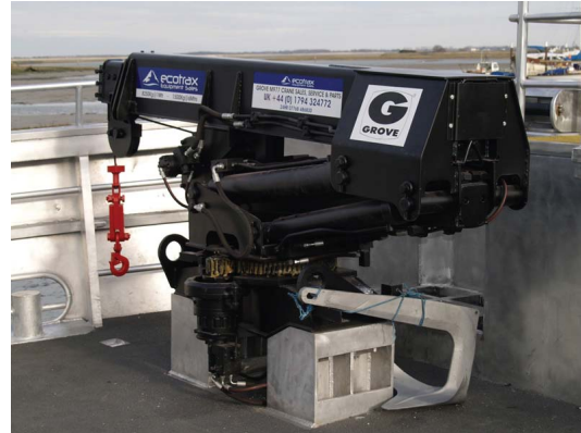
On Deck Crane